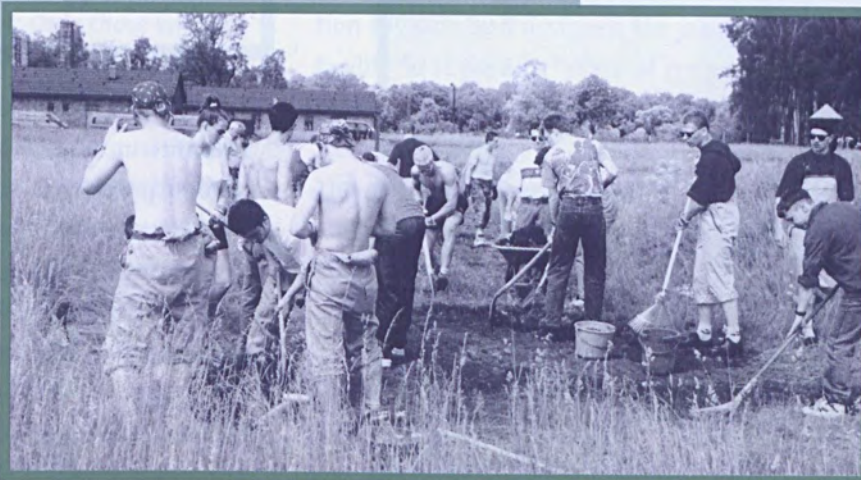
VW trainees at the site of the Auschwitz memorial