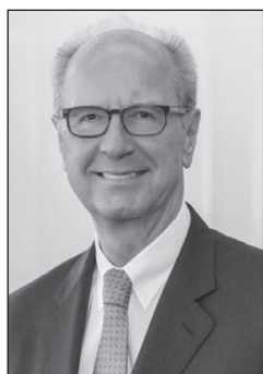
Hans Dieter Pötsch