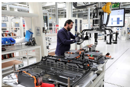
The battery systems for the e-Golf are produced at Brunswick.

Wolfsburg, July 2, 2018 – In future, Volkswagen’s component development and production activities are to become even more efficient and flexible. By analogy with the Volkswagen Passenger Cars and Volkswagen Commercial Vehicles brands, Components is to become an independent corporate entity under the umbrella of Volkswagen AG with effect from January 2019. The realignment process which is currently in progress is focusing on aspects such as changes in the structure of the business areas, slimmer management and board systems and a Group-wide added value strategy.