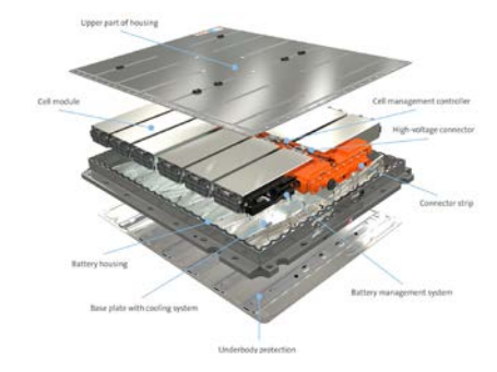
The components of the MEB battery system